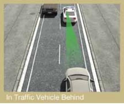
In Traffic Vehicle Behind