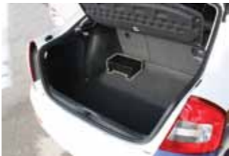
The ANPR processor's small size leaves most of the trunk space available for normal usage.

The main processing unit is designed specifically for the in-vehicle environment. It has an intelligent power supply that monitors the vehicle's battery to protect against deep discharge, integrates with the vehicle's ignition to provide programmed start-ups and shut-downs, and supports OS stand-by and hibernate modes. The processor is powerful enough to analyze 240 frames per second (from all the cameras combined). It has various connectivity options (3G, GPRS, Wi-Fi, serial, USB, Ethernet) and additional features (e.g. GPS). An in vehicle TETRA radio station can be used for data transfer. The main processing unit is equipped with a shock-mounted internal hard drive which is able to operate even while driving over rough terrain. The digital frame grabber and main processing unit are mounted in the vehicle's trunk so that they do not interfere with normal vehicle operation. The user interface unit is mounted adjacent to the car dashboard so that the officer can access it easily. It is equipped with a touch screen display that enables the officer to react quickly to any event detected by the system.