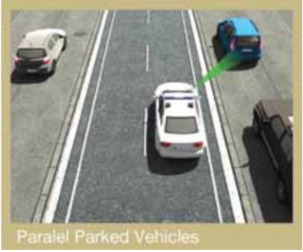
Parallel Parked Vehicles