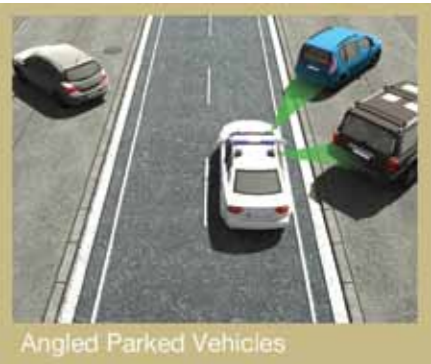
Angled Parked Vehicles