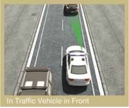
In Traffic Vehicle in Front

The system's configuration can be altered to fit any traffic environment.