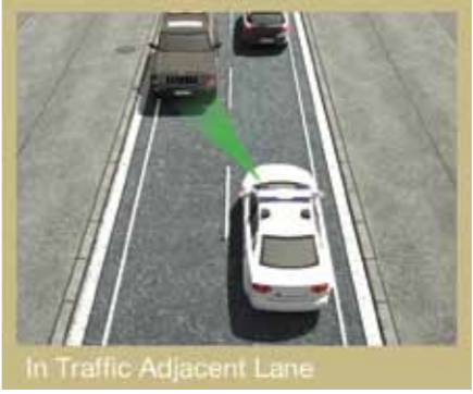
In Traffic Adjacent Lane