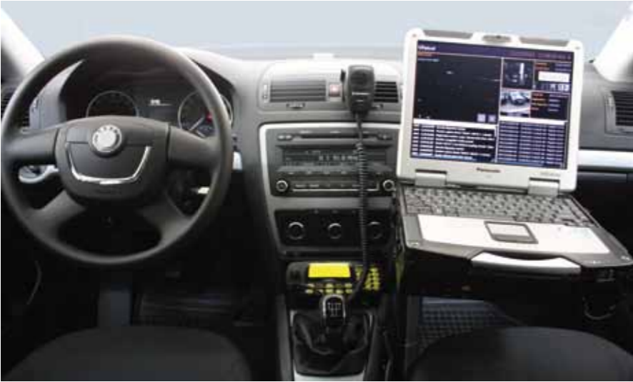
The vehicle interior is designed to increase officer productivity by enabling him/her to react promptly in any situation.