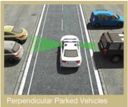
Perpendicular Parked Vehicles

ANPR cameras can be used for reading vehicle license plates in several different modes: - perpendicular parked vehicles on one side of the road, - perpendicular parked vehicles on both sides of the road, - angle parked vehicles, - parallel parked vehicles, - in traffic, in front of the patrol vehicle, - in traffic, behind the patrol vehicle, - in traffic, in the adjacent lane approaching from the opposite direction. The user has to mount the ANPR cameras in the desired direction in order to achieve the desired mode of operation.